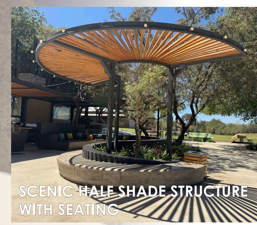
SCENIC HALF SHADE STRUCTURE WITH SEATING