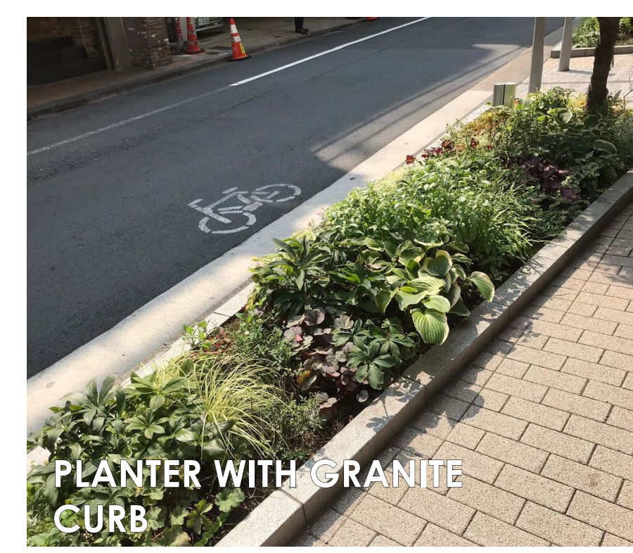
PLANTER WITH GRANITE CURB