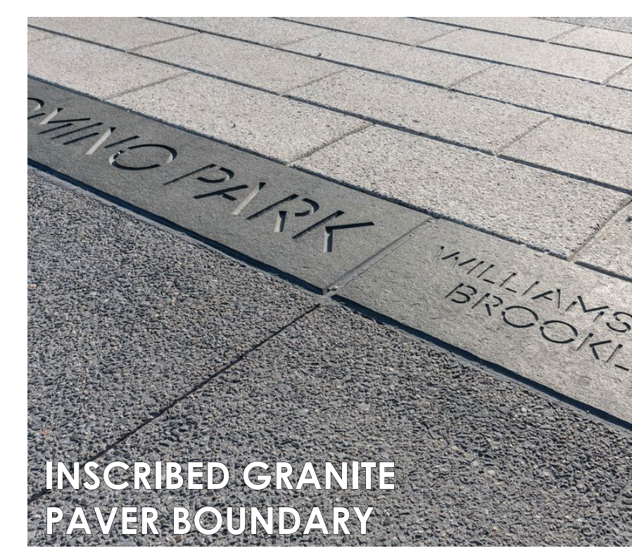
INSCRIBED GRANITE PAVER BOUNDARY