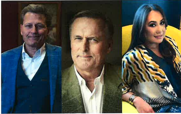
David Baldacci John Grisham will appear at Gala only Melissa de la Cruz