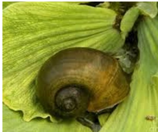
Channeled Apple Snail